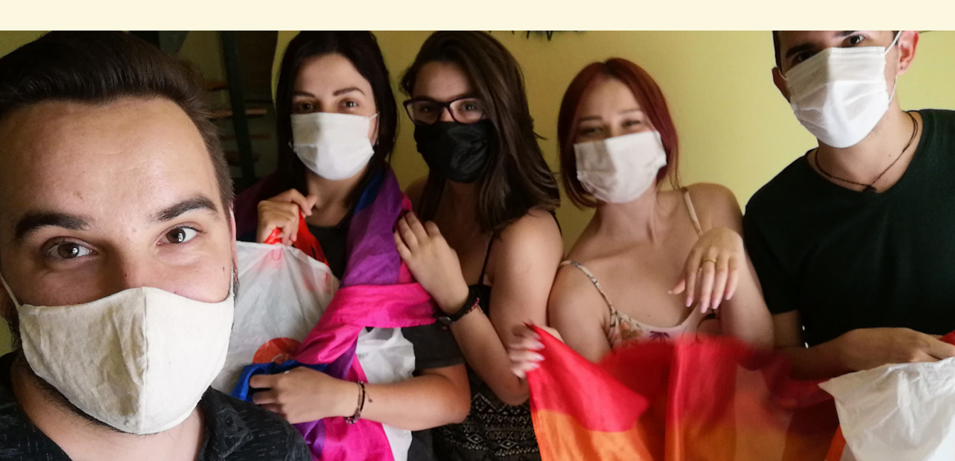
Below: Members of the group LGBT Forum Progress from Montenegro

With the help of these partners and hundreds of generous individual contributors, we have raised over $1.2 million US dollars – an impressive amount that meets only a fraction of the need.