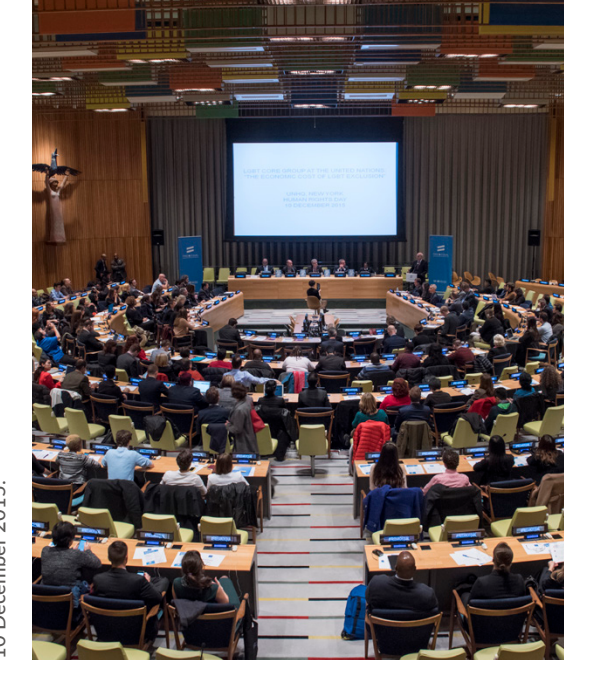
LGBT Core Group at the UN: The Economic Cost of LGBT Exclusion. UNHQ, New York, 10 December 2015.