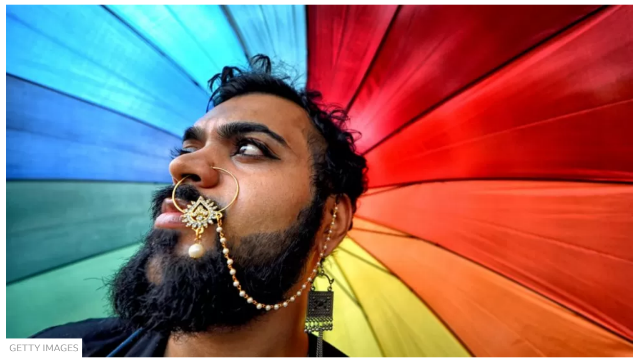
Before India legalised homosexual sex in 2018, at least one billion people in Asia lived with some form of anti-LGBTQ legislation