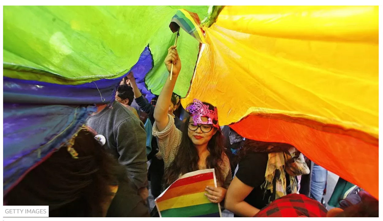
LGBT activists in India say there is still a long way to go in changing attitudes

Activists say more protection is needed, such as anti-discrimination laws. Earlier this month, a court in Chennai ordered officials to draw up plans for reforms to respect LGBTQ rights.