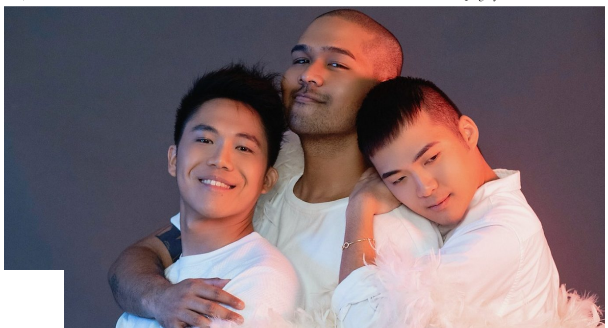
The lack of rights is one reason they find it difficult to return, as well as the refusal among some Singaporeans <u>including government ministers</u> to acknowledge that there is discrimination.