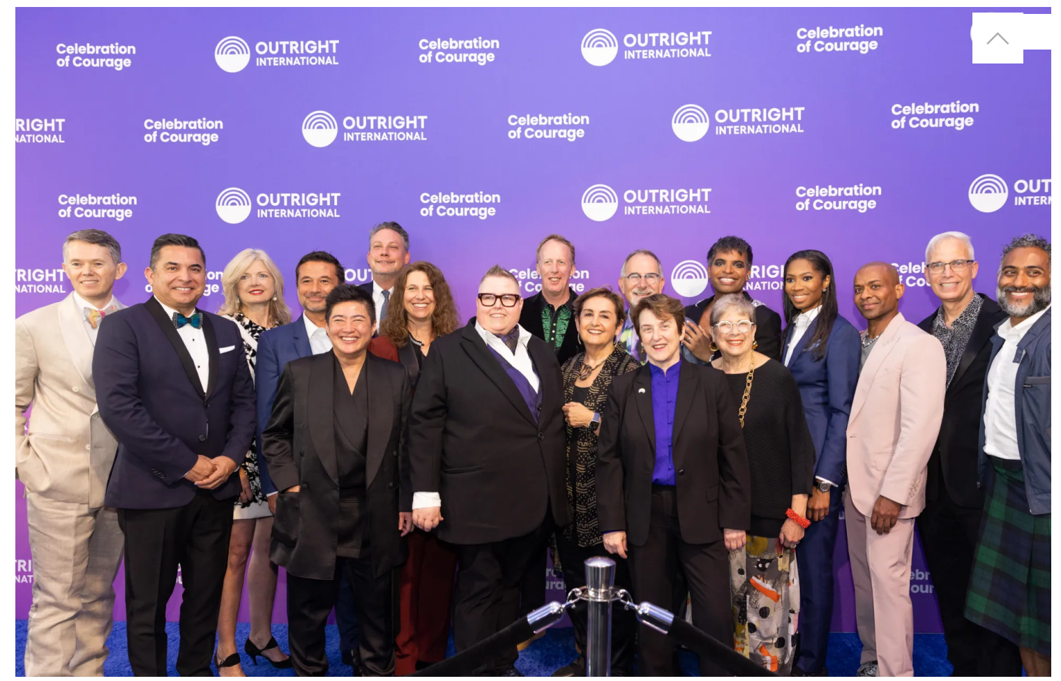
Board Members of Outright International at 2023 Celebration of Courage

Outright International Annual Gala Honors Queer Cast of Star Trek: Discovery - The Knockturnal