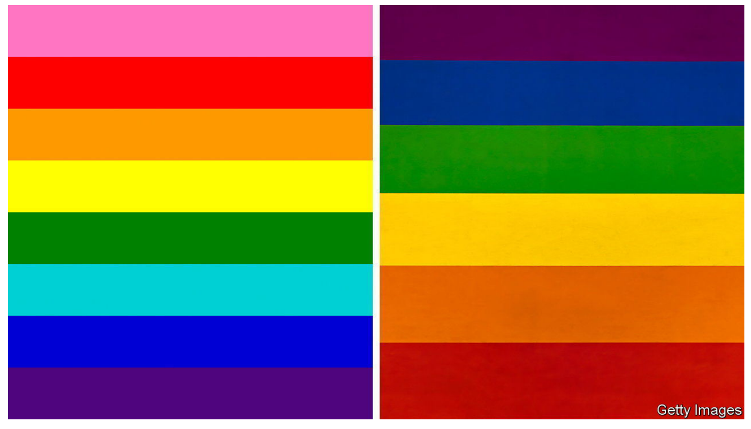
Gilbert Baker's original Pride flag (left) and the familiar rainbow flag (right).

At Pride parades today the white, pink and blue stripes of the transgender flag are often on display. In 2017 the city of Philadelphia added brown and black stripes to the rainbow flag to represent racial minorities. The "Progress Pride flag", designed by an artist in Portland, Oregon in 2018, overlays the traditional rainbow banner with a black, brown, blue, white and pink chevron to recognise trans people, black and brown folk and the thousands who died during the AIDS epidemic. A newer version includes a purple circle and yellow triangle. These represent intersex people, who are born with anatomy that is not exclusively male or female. Even this flag is probably not the final version.