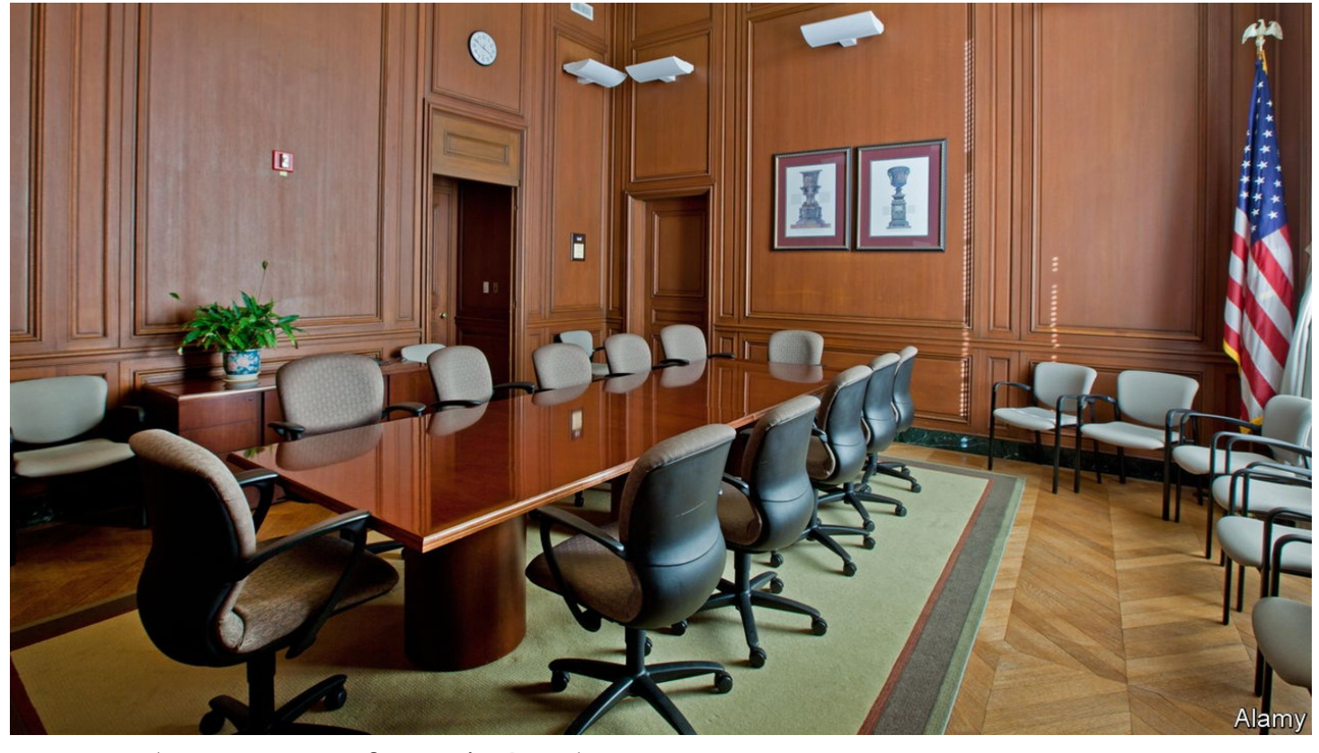
How ESG became part of America's culture wars

A focus on social issues by big business has angered some Republicans