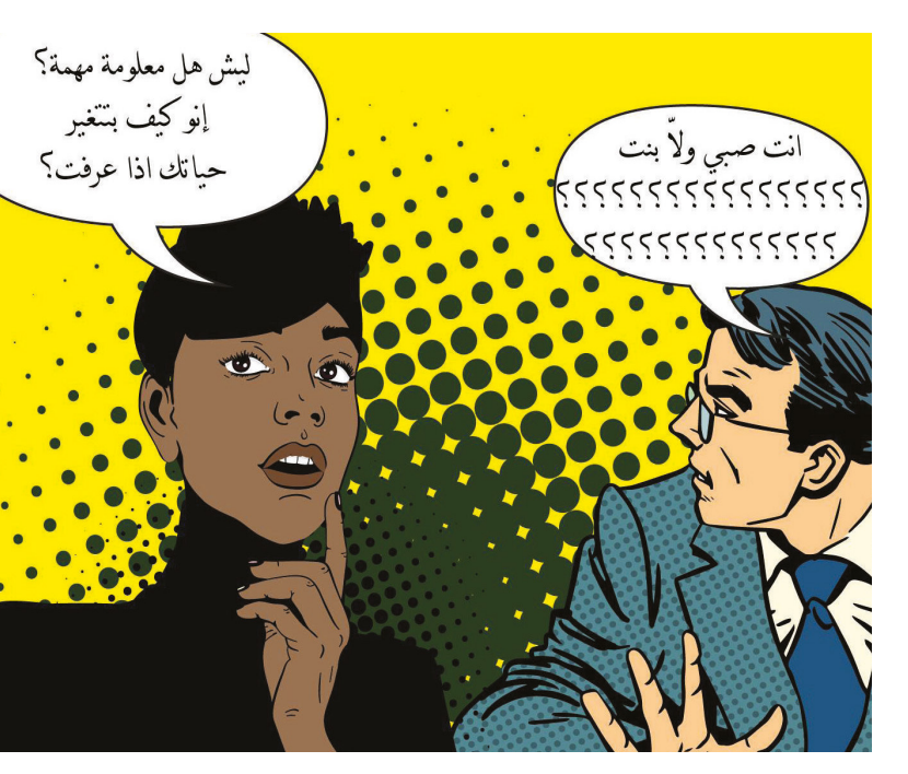
Above: Comic from Kharabish Nasawiya - Feminist doodles