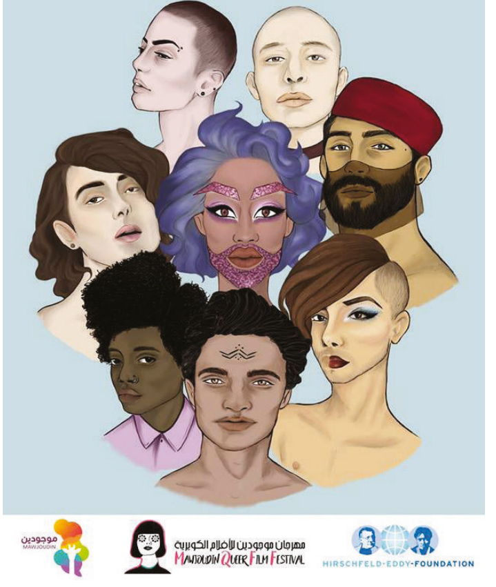
Above: Mawjoudin Queer Film Festival

More recently, Mawjoudin launched a queer film festival in January 2018. The festival showed 12 films in Tunis, including Tunisian and regional productions.<sup>375</sup>