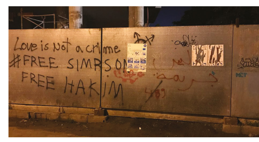
Above: Graffiti campaign in Rabat against Article 489

Morocco does not have legislation or regulations that allow for name or gender changes in official documentation.<sup>232</sup> As a result, transgender people find themselves in a legal vacuum, with the lack of recognition restricting their ability to access services.<sup>233</sup>