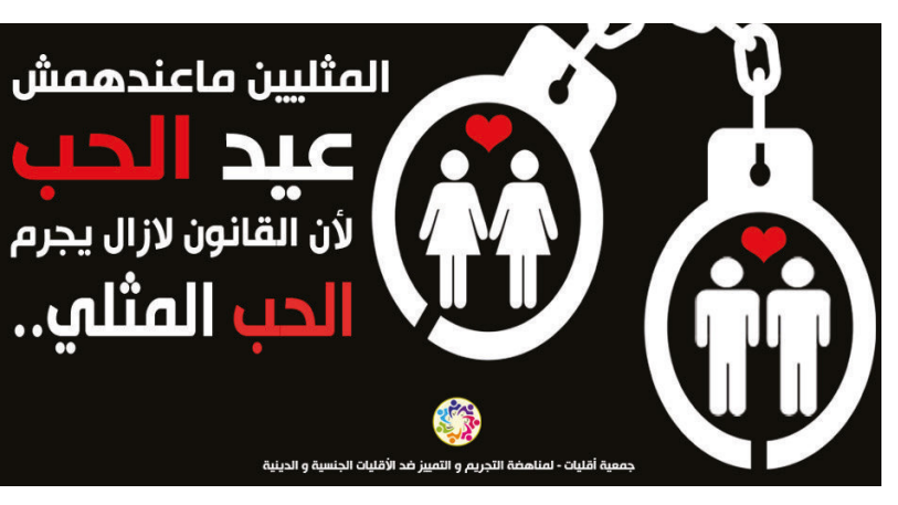
Above: Akaliyat's campaign against Article 489

The language used in Article 489 is gender-neutral, and therefore the law can be applied to women, men, and transgender people. An activist working on transgender rights with ASWAT Collective, which advocates for LGBTQ people in Morocco, reflected that while there is a legal vacuum regarding transgender people and their status in Morocco, law enforcement officials often associate transgender people with homosexuality.<sup>218</sup> Therefore, Article 489 continues to be used against trans people, often on the basis of their gender expression not conforming to official identity documents.<sup>219</sup>