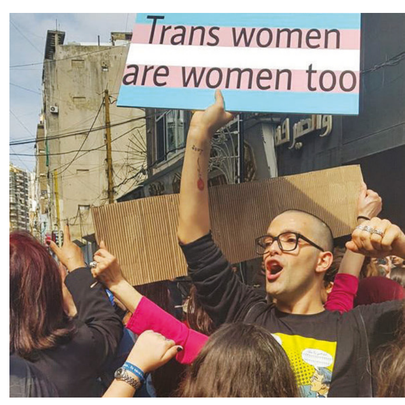
Above: Photo from 2018 Women's March in Beirut, Lebanon

Meem's legacy continues through the publication of Bareed Mista3jil , a collection of stories documenting the experiences of LBTQ women in Lebanon. A former member of Meem explained the significance of the collection: