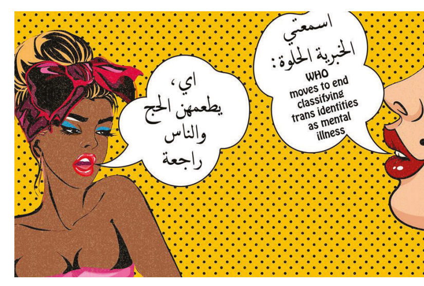
Above: Comic from Kharabish Nasawiya - Feminist doodles