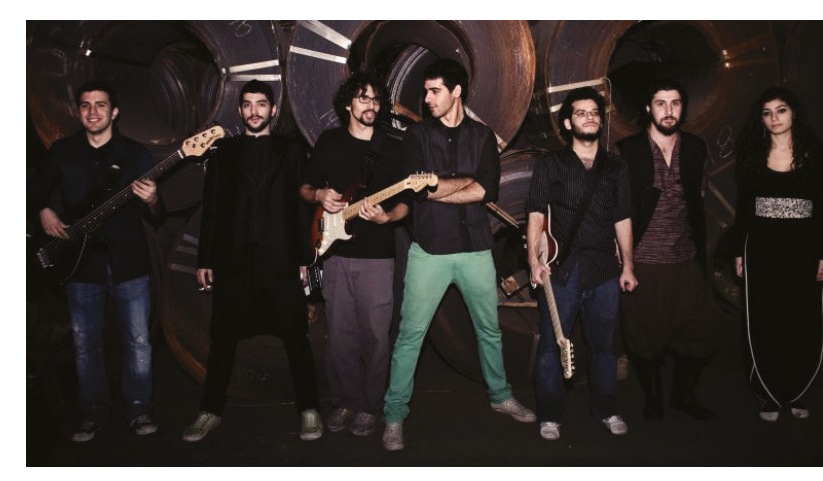
Above: Mashrou' Leila

Priority is given to people with [traditional] families to support. As a result, we hear of cases of both LGBTQ men and women engaging in sex work to survive.<sup>38</sup>