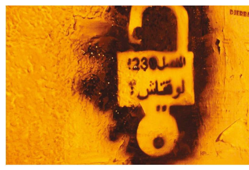
Above: Street art campaign against Article 230

Consensual same-sex sexual relations are criminalized under Article 230 of the Tunisian Penal Code; those convicted under the article face up to three years of imprisonment.<sup>300</sup> The origins of Article 230 date back to