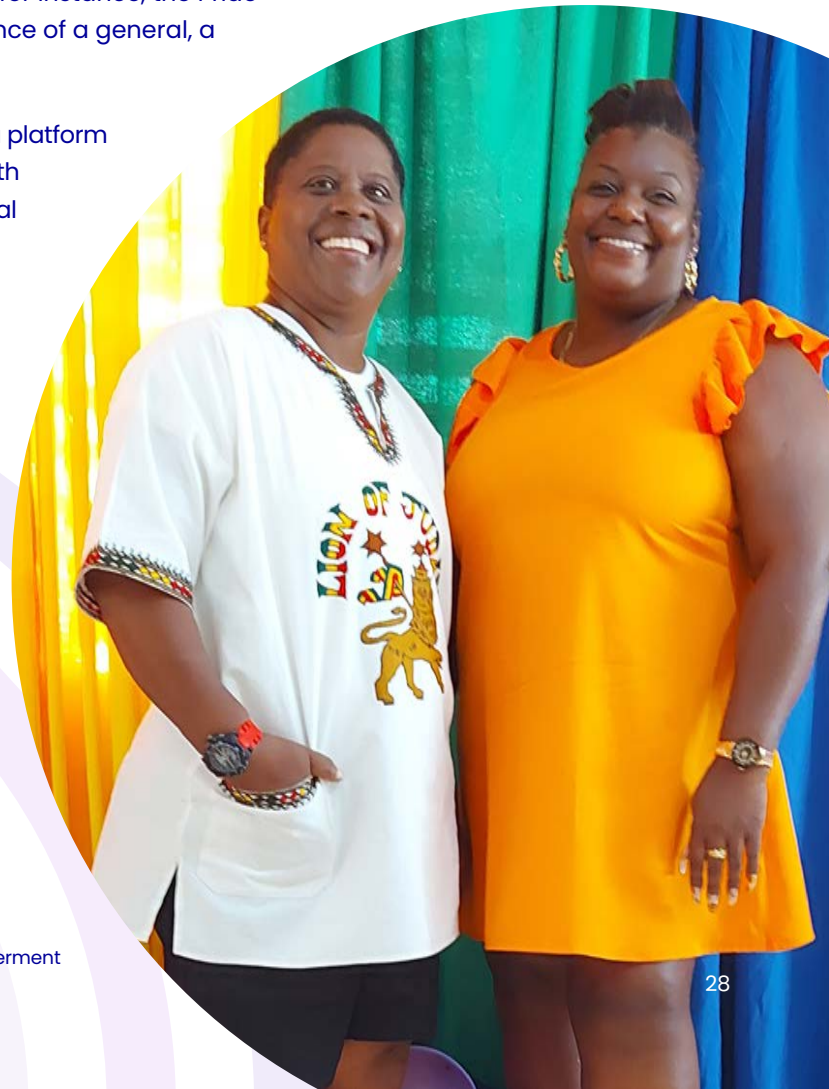
Right: Community Pride Celebration in Belize, 2023.