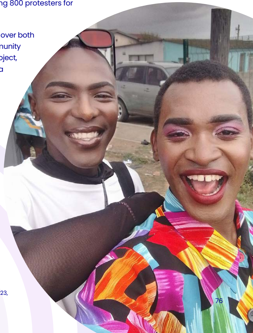
Right: Participants attending the Port Elizabeth All-Gender Netball Game in 2023, South Africa.

Pride differs depending on where you are in South Africa. There are two types of Pride. There is Pride for celebration—having fun, meeting people, and being flamboyant. Then, the other kind of Pride is on protest and resistance—more focused on remembering those who passed on due to hate crimes and highlighting the injustices that happen in Black communities around queer people being murdered [and discriminated against] for who they are. 423 However, there have been a lot of divisions based on class and race. 424