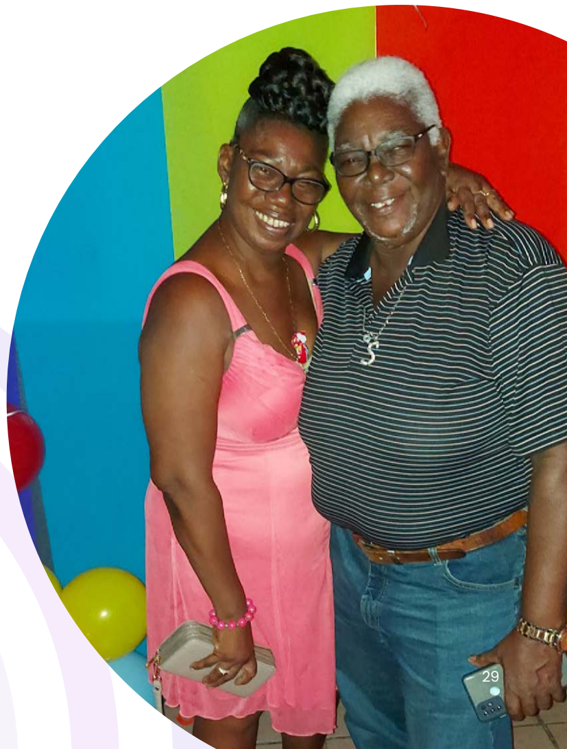
Right: Community Pride Celebration in Belize, 2023.

Pride creates a sense of belonging because it’s a time where, while we may not have the full support of the state, we can bring forward our issues to celebrate and discuss our concerns. At Pride, throughout August, people are listening, allowing us to discuss how to get our problems out there and do what needs to be done. It allows us to be a collective and understand our mandates and collective struggles beyond the rainbow balloons and glitter. It provides a platform to be visible, support, and understand one another. 141