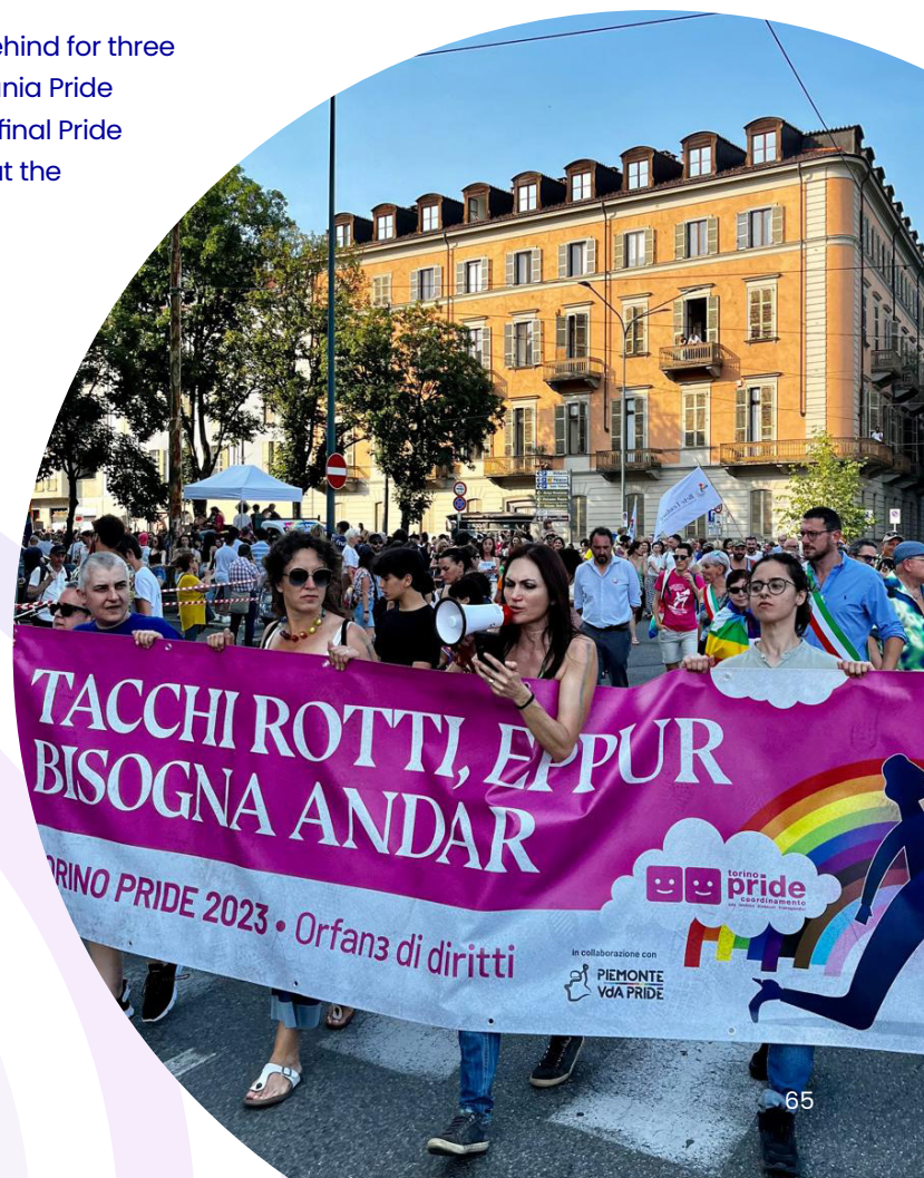
Right: Turin Pride, 2023.

Similarly, Milan Pride provided interpretation services from and into spoken and signed languages during the 39 pre-Parade events, during the Pride Square Festival, and the grand finale on 24 June 2023. Organizers of Milan Pride also guaranteed visibility of the finale via live online streaming and provided a wheelchair-accessible parade route with several adjacent quiet areas. 350