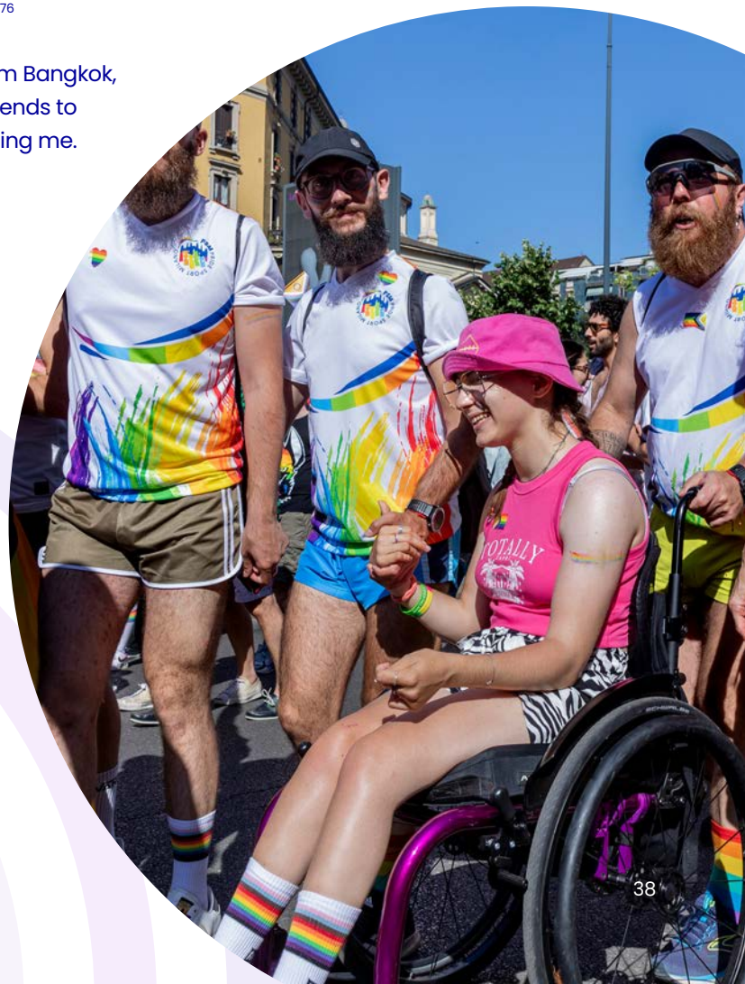
Right: Milan Pride, 2023.

I was part of the press conference after Pride. It was located far away from where the Pride march ended. As an ambulatory wheelchair user, I took my wheelchair, but traveling was not easy at all. I had to take the BTS [Bangkok Sky Train mass transit system] and ask for help from staff at the station to board the train. 178