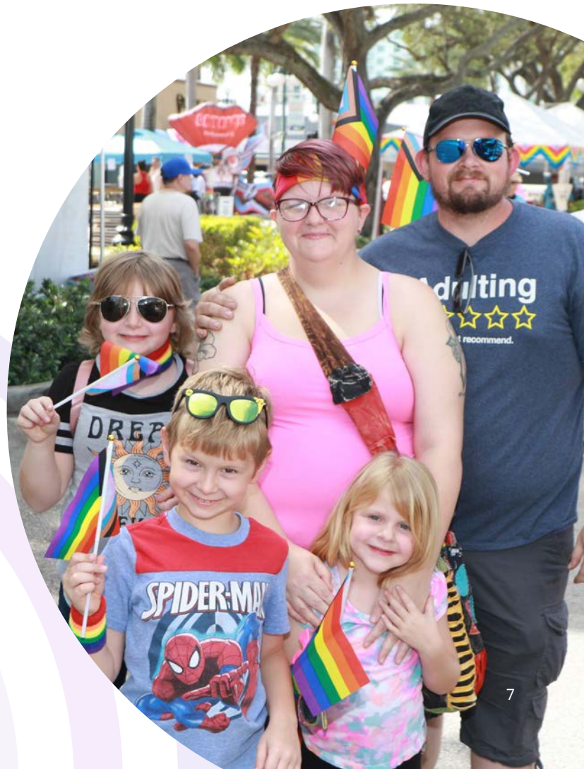
Right: A family attends My Hollywood Pride, 2023.

Second, Outright typically uses the acronym LGBTIQ when referring to movements, laws, or events that are truly relevant to and inclusive of the range of identities included in the acronym. In some cases in this report, we report on events that, to our knowledge, did not include intersex people, or on laws that only target people based on sexual orientation or gender identity, and not based on sex characteristics. In these cases, we use the acronym "LGBTQ," omitting the "I" for "intersex." We sometimes also use "queer" as an inclusive catch-all. We recognize our choice of terms and acronyms may be at times inconsistent and imperfect as a result of gaps in our knowledge, complexity and fluidity in our communities, and identities that no term or acronym can perfectly capture.