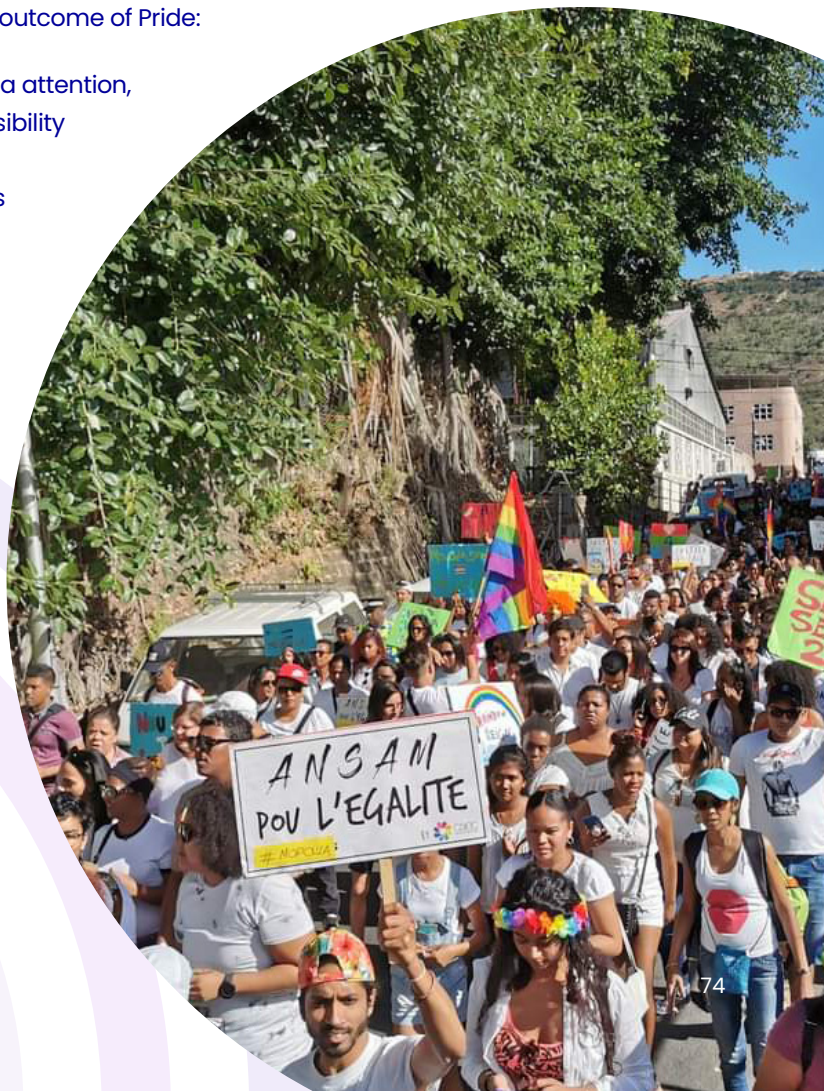
Right: Pride March in Mauritius.

I'm kind of lucky. I'm able to voice out and show that we exist and work towards removing the misconceptions society has about queer people. I'm lucky to have the opportunity to stand up and say I'm queer without being sentenced to prison. 411