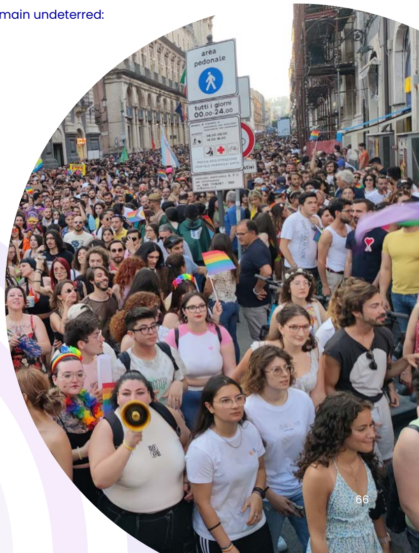
Right: Catania Pride, 2023.

In the face of government intransigence, Italian activists remain undeterred: a rainbow will continue to run through Italy.