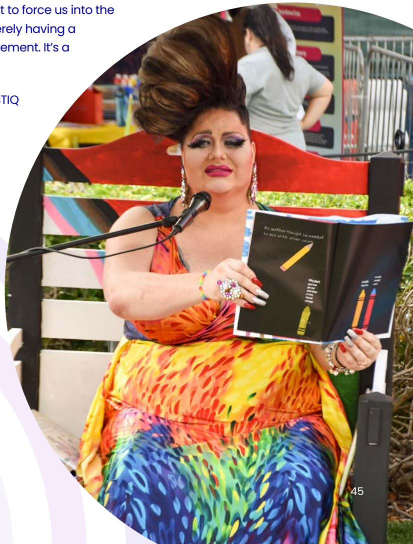
Right: Drag Queen at a Storytime session, My Hollywood Pride, 2023.

Our job as a movement and as activists is to make our Pride celebrations what we want them to be. We need to take the opportunity of Pride to make sure that we are doing the right kinds of work and trainings, organizing ourselves from within, organizing ourselves as activists to do the work that we need to do, whether that be registering people to vote, whether that be going and providing public testimony at a school board so that we can fight back against the banning of books that feature LGBTQ characters or authors or seeing whatever that work needs to be. It's incumbent upon us to go out and do it. We've got to go do it. 223