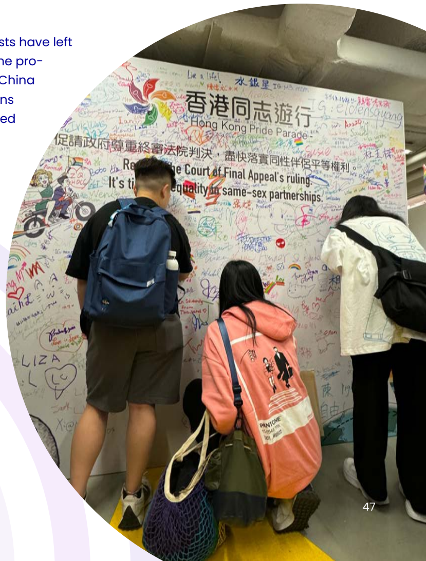
Right: Pride in Hong Kong

Under government pressures, many pro-democracy activists have left Hong Kong, leaving others to explore ways to coexist with the pro-China government. 229 Some groups have even invited pro-China legislators to support their events, stirring up mixed emotions within the community. In 2023, Hong Kong Gay Games invited Regina Ip, the pro-Beijing lawmaker and former security minister to open the event. 230 One Hong Kong-based activist whom Outright interviewed said that the Hong Kong government aims to use pinkwashing to divert attention from other human rights violations.