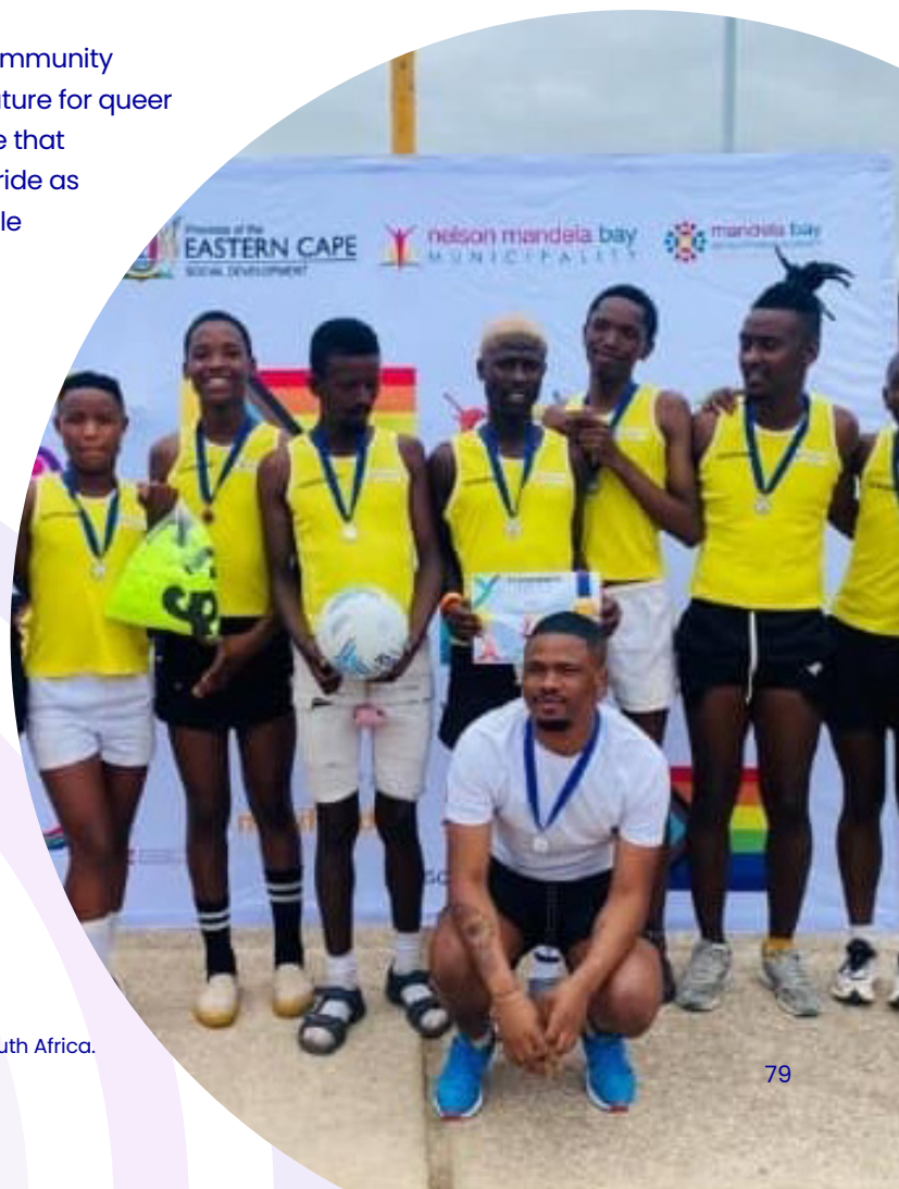
Right: Some players at the Port Elizabeth All-Gender Netball Game in 2023, South Africa.

Not where we have to fly to Cape Town or Johannesburg, but [where] people from [major cities] fly to a small town to celebrate, not with fancy things, but as a struggle and as a reminder that we can't say we are free until we are all free. So that all queer people, including Black queer people, are also free. I hope Pride grows to have this culture. 454