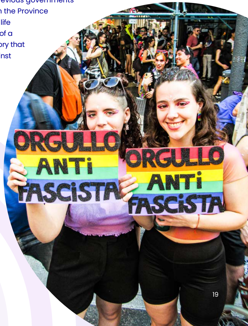
Right: Pride March in Buenos Aires, Argentina, November 2023.

A common sentiment expressed by LGBTIQ activists is fear of possible new government measures and the escalation of anti-gender narratives that endanger LGBTIQ people. But that fear is accompanied by a firm conviction to fight for and defend the rights won in recent decades and to continue advancing along the path of true freedom and equality.