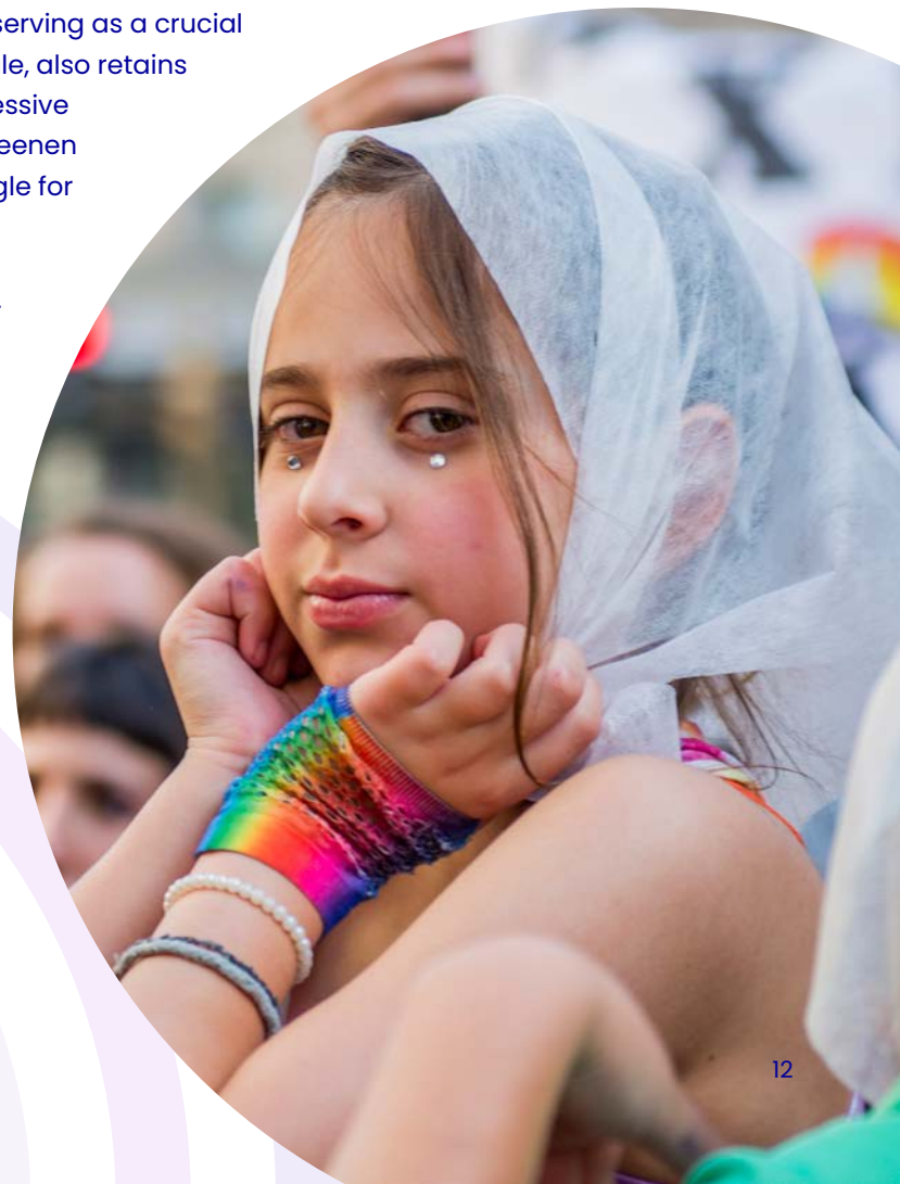
Right: Pride March in Buenos Aires, Argentina, November 2023. Credit: Asociación Familias Diversas de Argentina (AFDA).

Pride [is] a contemporary battleground for civil rights. Much like the liberation struggle, Pride Marches challenge the status quo and demand that the constitutional promises of equality be extended to all, irrespective of sexual orientation or gender identity. They serve as a collective assertion that the LGBTIQ+ community will not accept being relegated to the margins or denied their fundamental rights. The visibility and activism inherent in Pride events symbolize a continuation of the legacy of those who fought for justice and equality during the apartheid era. 46