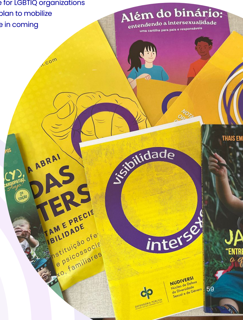
Right: Brazilian Intersex Association’s (Associação Brasileira Intersexo, ABRAI) informational materials at the São Paulo Pride Fair, 2023.

The day before, I couldn’t even sleep, knowing that I would be there at the opening of the parade with the flag. It was a very significant moment for us, and I was ecstatic seeing the flag fly. It felt like a dream, and I cried thinking about how difficult it was to get here. 284