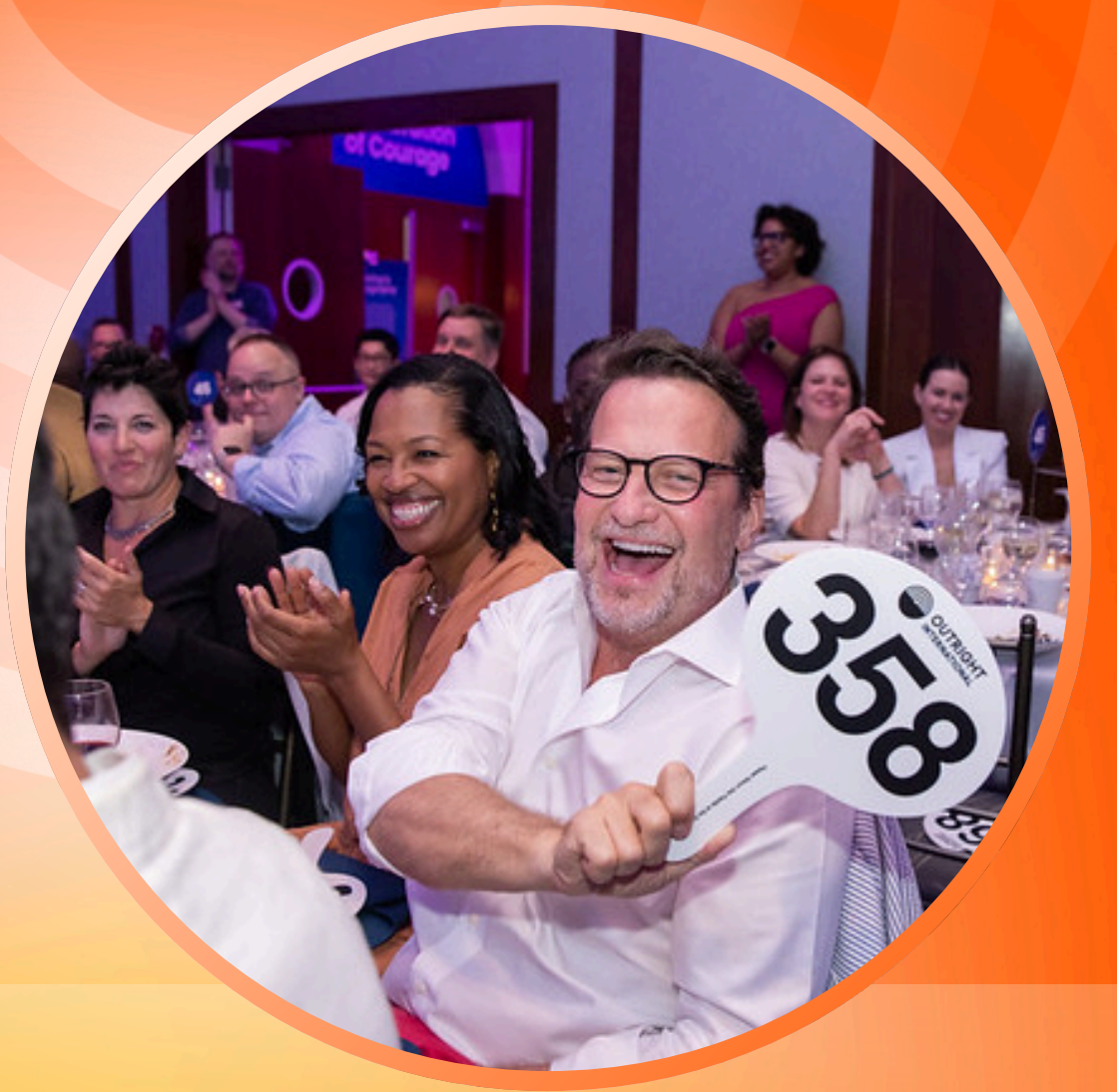
Table Captains commit to purchase a table , build a table by selling tickets to fill a table and/or recruit other Table Captains. For more information on purchasing a table or filling a table at Celebration of Courage , please contact Evan. Evan can also answer questions regarding invoicing and payment options via check, wire transfer or credit card.