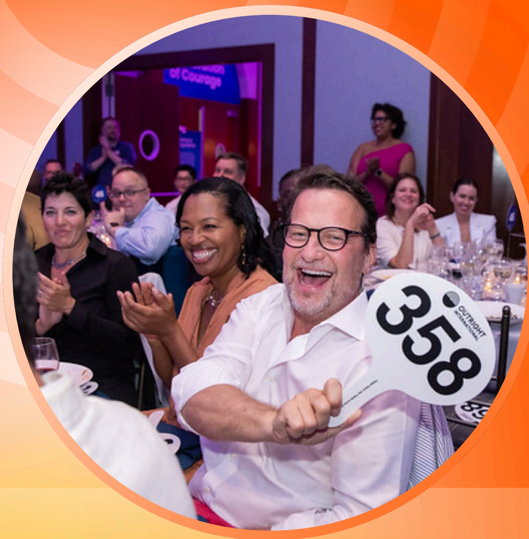
Table Captains commit to purchase a table , build a table by selling tickets to fill a table and/or recruit other Table Captains. For more information on purchasing a table or filling a table at Celebration of Courage , please contact Evan. Evan can also answer questions regarding invoicing and payment options via check, wire transfer or credit card.