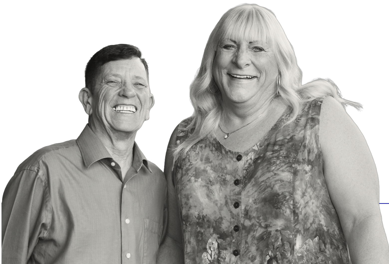
Image: Happy transgender male and female outside