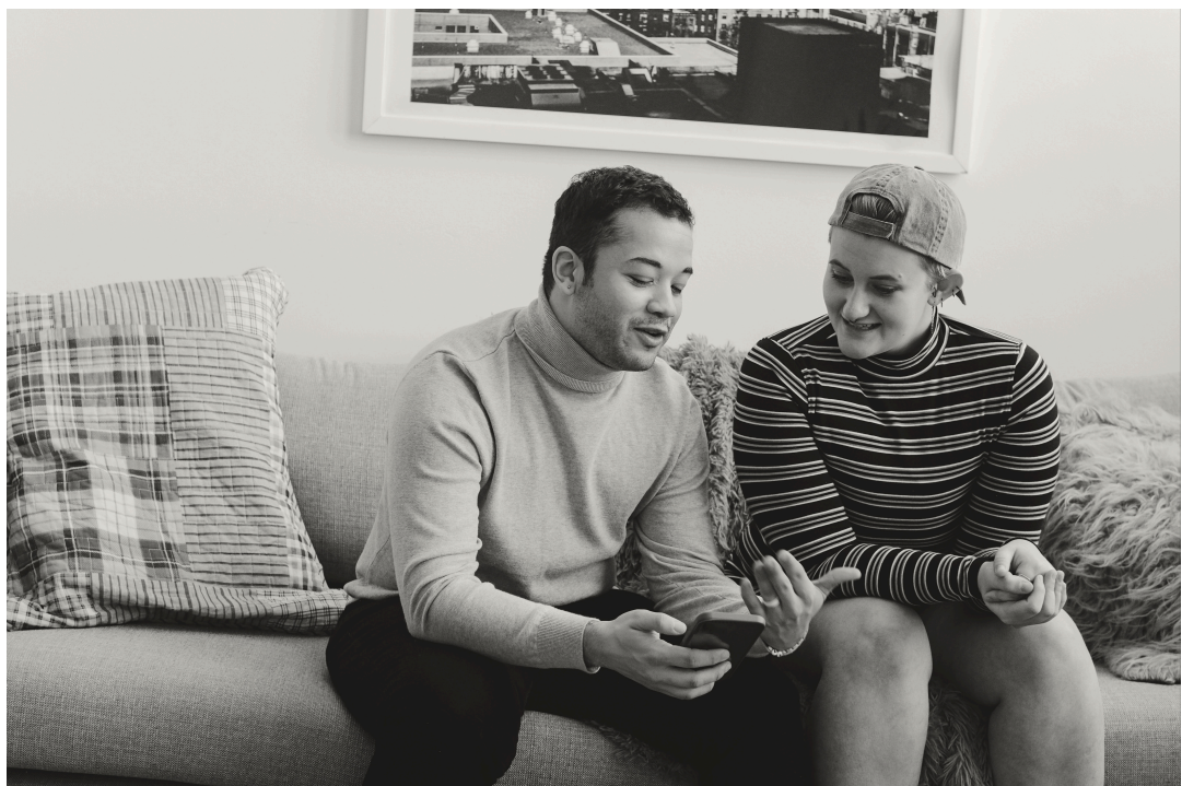
Image: Trans couple sitting on couch

Alex, a trans man, and his partner, Ethan, dream of having children. But when Alex seeks to preserve his eggs before starting gender-affirming hormone therapy, he is met with high costs and a lack of supportive medical providers . The couple also faces discriminatory policies that exclude same-sex partners from IVF access. These barriers delay their plans for parenthood and cause unnecessary emotional and financial stress.