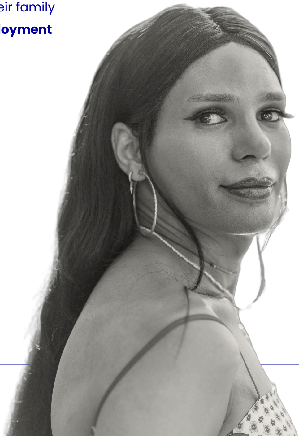
Image: Transgender woman turning to look at the camera