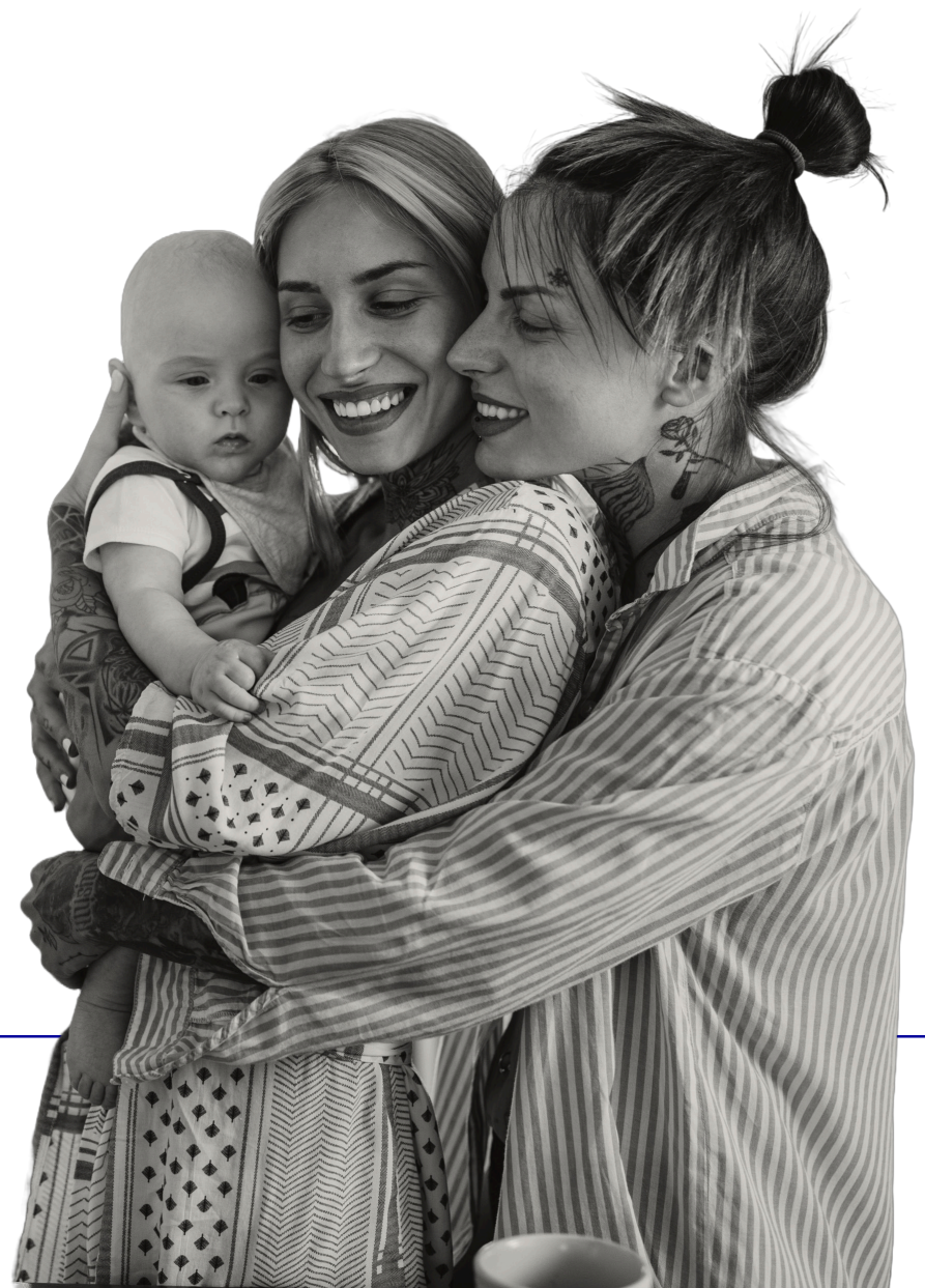
Image: Two lesbian women with a baby boy at home