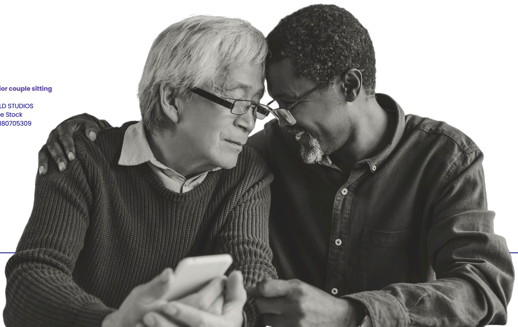
Image: Senior couple sitting indoors