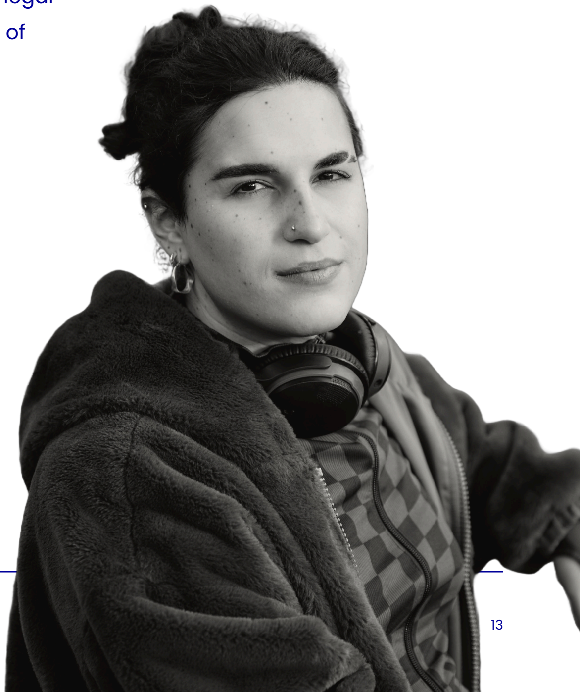
Image: Young woman sitting in the park

Jamila is in an abusive relationship with her same-sex partner. When she finally gathers the courage to file for a restraining order , she is told that domestic violence protections do not apply to same-sex couples . Left without legal recourse, she remains trapped in a cycle of violence and fear.