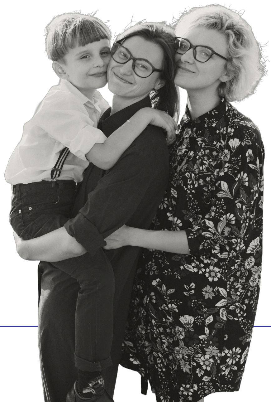
Image: Same sex caucasian lesbian family with a child