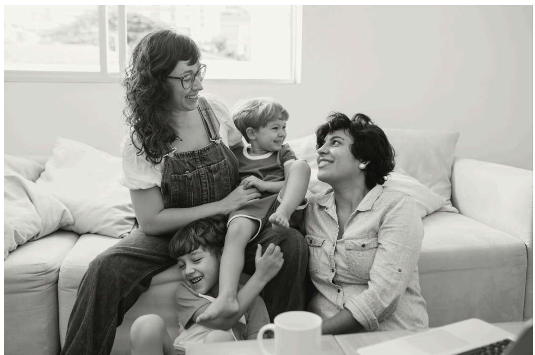
Image: Happy LGBT family

Aisha and Claire, a married couple, have twins through IVF —with Claire as the biological mother. When they move abroad for work, the local government refuses to recognize their marriage or Aisha’s parental rights. This means Aisha cannot enroll the twins in school, make medical decisions, or secure residency as their legal parent. Without internationally recognized family protections , LGBTIQ families face separation, uncertainty, and legal battles.