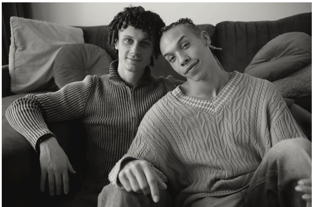
Image: Two young multiracial men sitting on living room

John and Miguel have shared a home for 20 years . But when Miguel passes away suddenly, his estranged siblings claim ownership of their house , arguing that John has no legal standing. Without explicit protections for same-sex property and inheritance rights , John is evicted from the home he built with Miguel , left grieving and financially vulnerable.