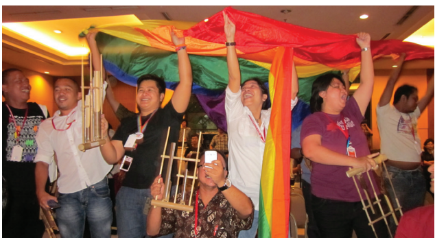
Taken in Jakarta at the 2011 ASEAN People's Forum where activists from different social justice movements gathered to build solidarity around common priorities in the region. This photo shows LGBT activists meeting for the first time at an IGLHRC workshop to discuss human rights in the ASEAN region. This workshop subsequently led to the formation of the ASEAN SOGIE Caucus.