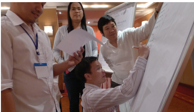
Thai LGBT activists strategizing with IGLHRC on how to work with National Human Rights Institutions.