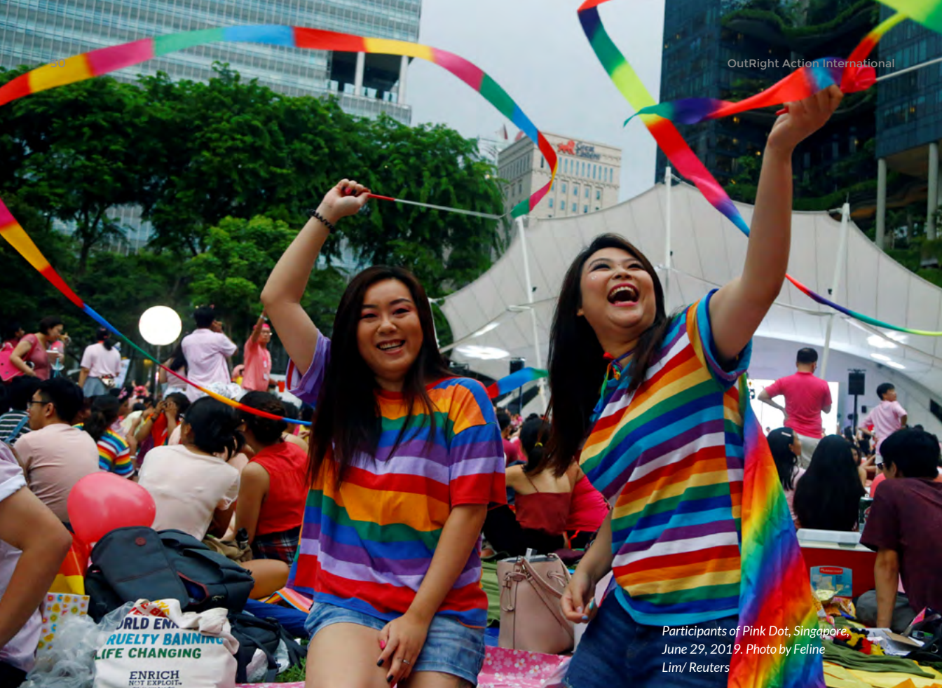
Participants of Pink Dot, Singapore, June 29, 2019.

Freedom of assembly overall is a primary issue for democracy campaigners in Singapore. Although guaranteed by the Constitution, freedom of assembly can be legally restricted for the purpose of security and public order. For example, despite the loosening of regulations on public gatherings, police still monitor Pink Dot closely to make sure foreigners are not allowed in, as per the amended 2017 Public Order Act. 108 The 2021 Political Donations Act prohibits foreign funding of any “political association”, and outlaws anonymous donations. 109 In these ways, the state tries to keep a lid on protest, seeing it as “against the ‘national interest.’” LGBTIQ visibility is seen as divisive, and the government’s argument is to “let the conservative Singaporeans evolve on this topic.” 110