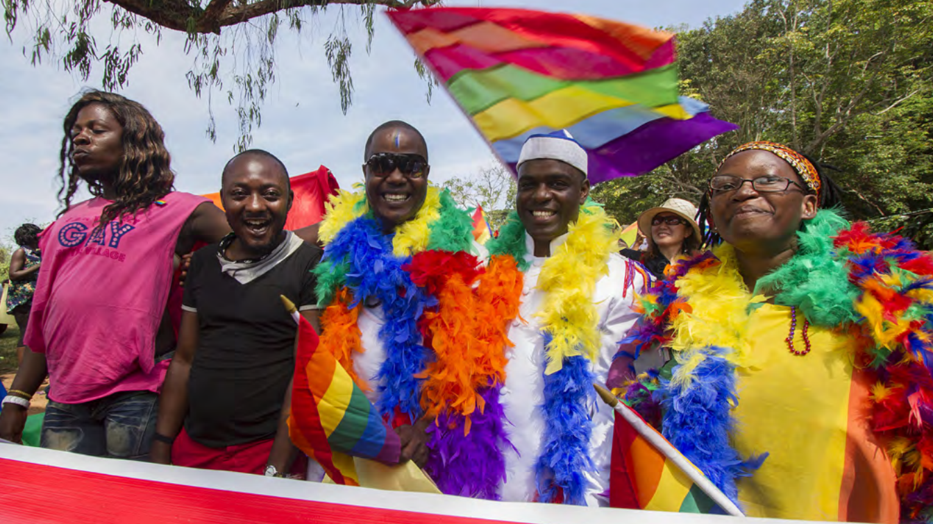
People hold rainbow flags as they take part in the Pride event in Entebbe on August 8, 2015.

This is the simple fact of life for LGBTIQ people and their families and allies in Uganda. Ugandan society is socially conservative, and anti-LGBTIQ sentiment is further fueled by some Christian churches, which take a hard anti-LGBTIQ line. Historically, this view has been promoted and even funded by fundamentalist churches in the USA, which have sent missions to Uganda. 84