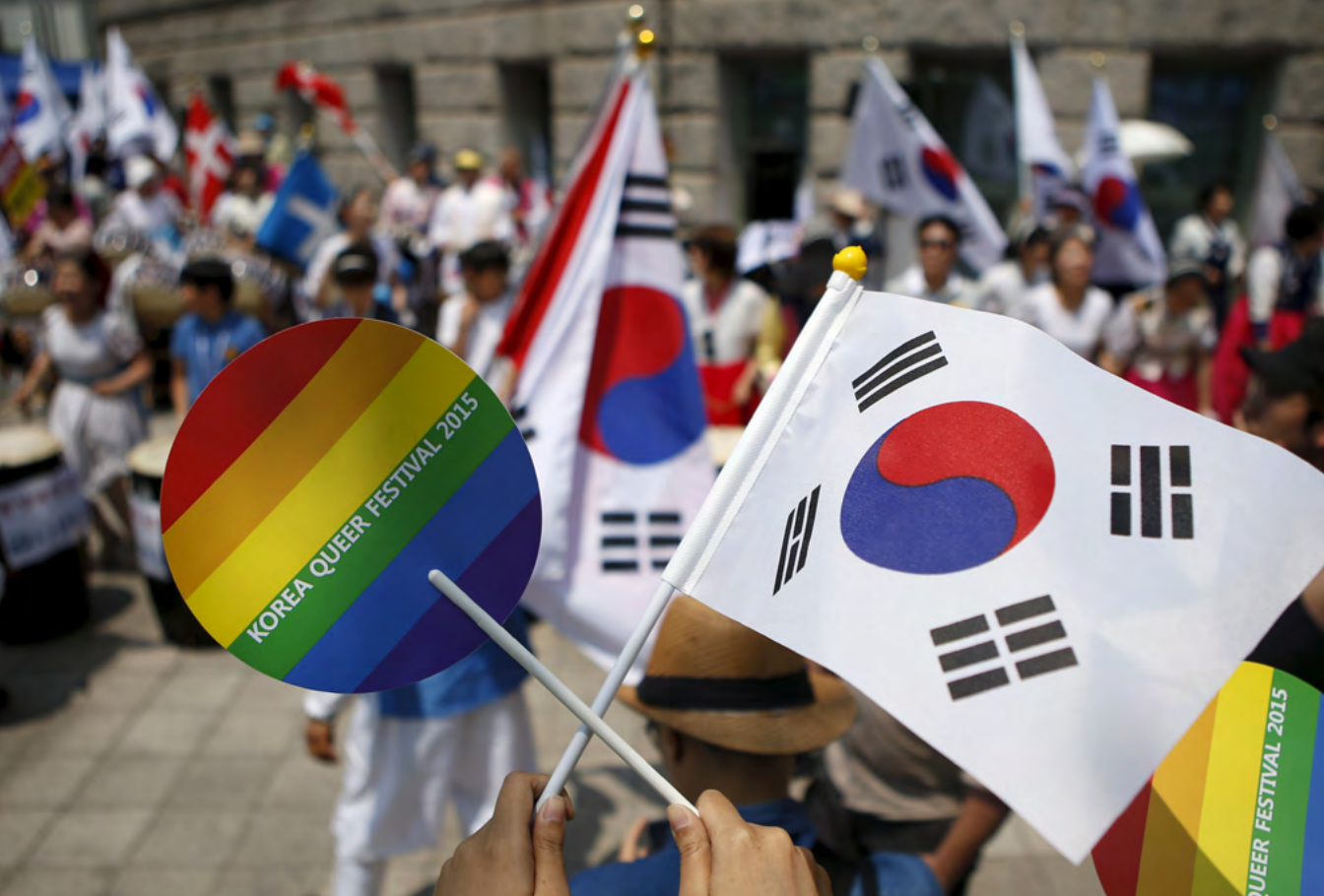
A participant holds up a rainbow-coloured fan and a South Korean national flag as they face Christian groups, during Korea Queer Festival 2015 in central Seoul, South Korea, June 28, 2015.