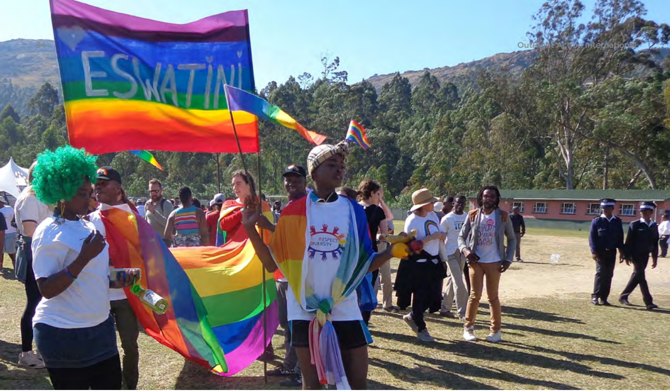
People take part in Eswatini's (formerly known as Swaziland) first Pride in Mbabane on June 30, 2018.