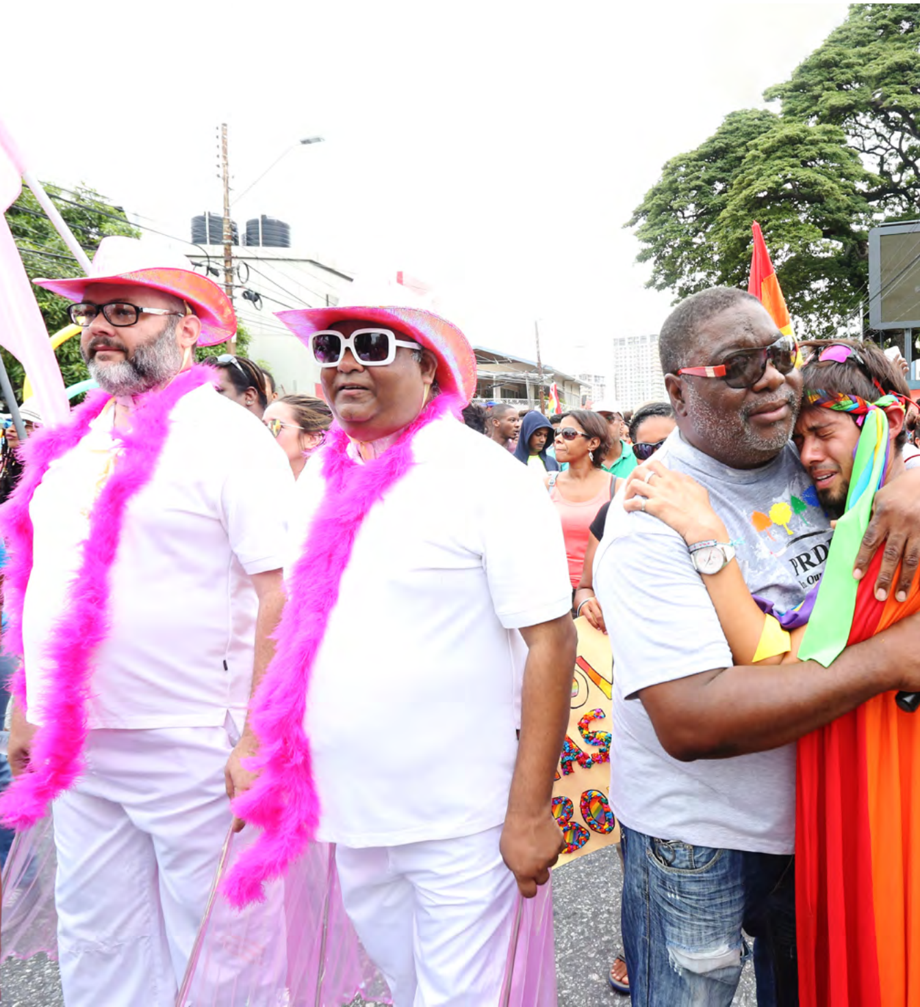
The first annual Pride Arts Festival takes place in 2018 in the city of Port of Spain.