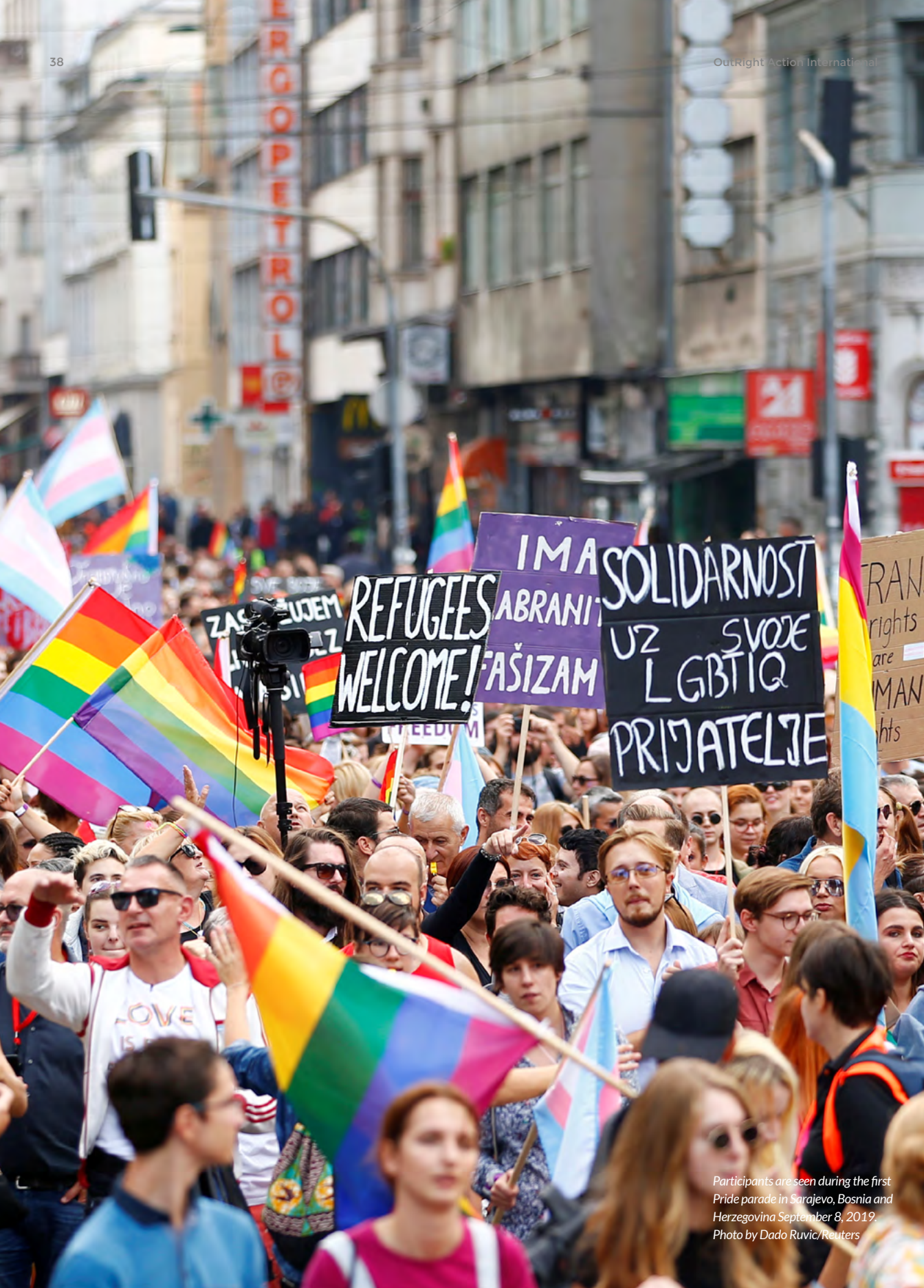
Participants are seen during the first Pride parade in Sarajevo, Bosnia and Herzegovina September 8, 2019.