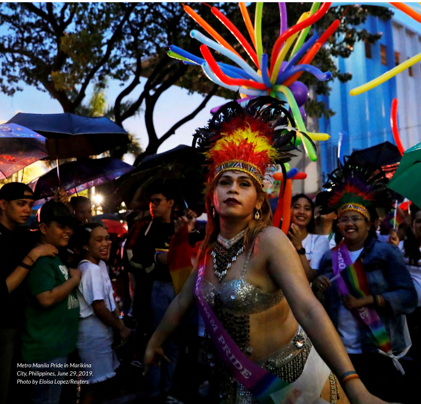
Metro Manila Pride in Marikina City, Philippines, June 29, 2019.

In the Philippines close coordination with local government and municipalities is necessary for organizing large scale, public events. As such, Pride events are typically organized several months in advance. Most events tend to take place in June.