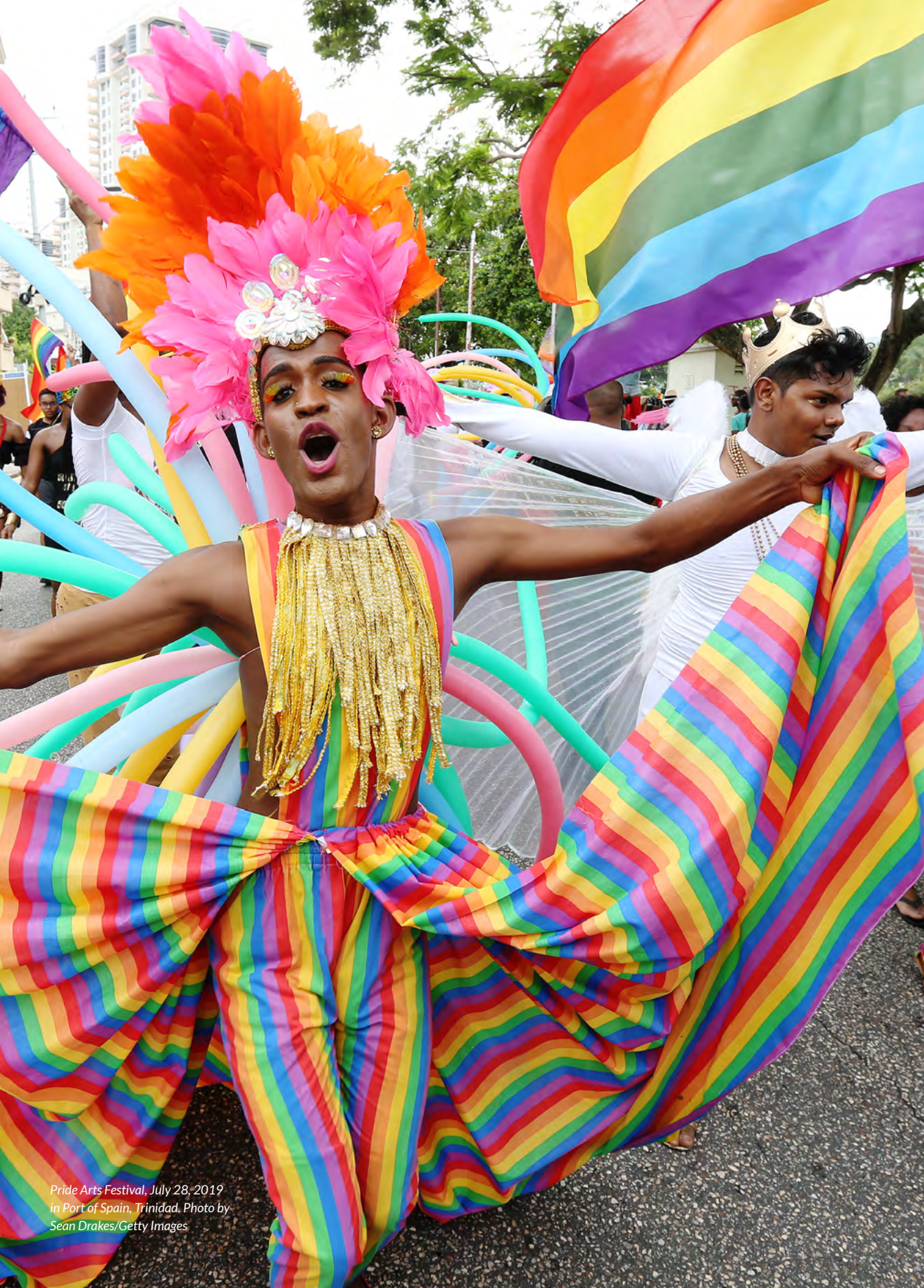
Pride Arts Festival, July 28, 2019 in Port of Spain, Trinidad.