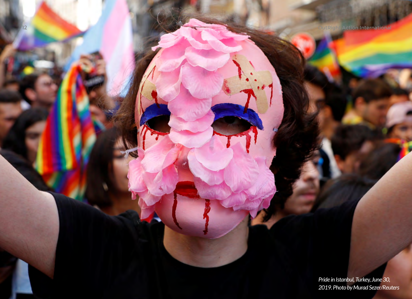
Pride in Istanbul, Turkey, June 30, 2019.

to poison young minds.” Moreover, he openly incited the public to violence by urging the public to confront “any type of perversion forbidden by our God, and those who support them”. 39